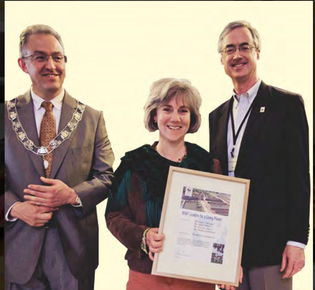
Ahmed Aboutaleb (Mayor of Rotterdam)

WWF is also known as World Wildlife Fund.